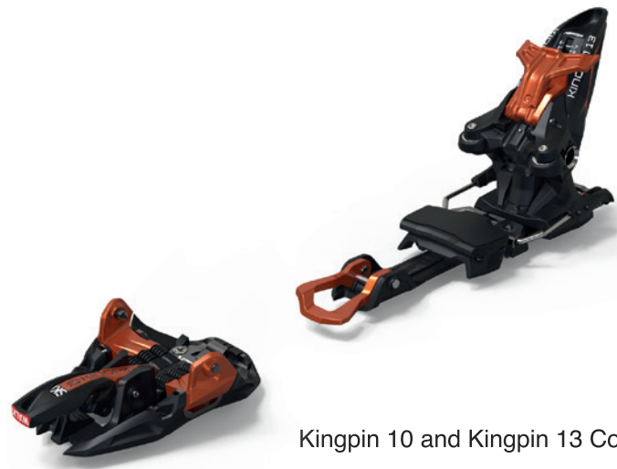
Kingpin 10 and Kingpin 13 Copper

Hazard: The Pin in the toe piece can break under rare circumstances. This can lead to reduced release/retention and can result in a fall hazard.