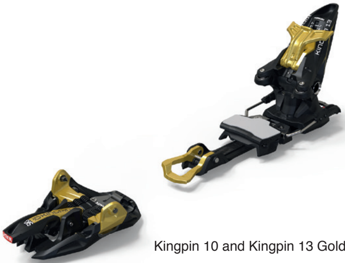
Kingpin 10 and Kingpin 13 Gold

Marker Recalls 2017-2018 Kingpin 10 and 13 Touring bindings toe parts.